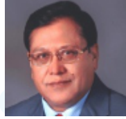
DR. V. K. SARASWAT MEMBER, NETI-AMOG CHANCELLOR OF JAWAHARLAL NEHRU UNIVERSITY